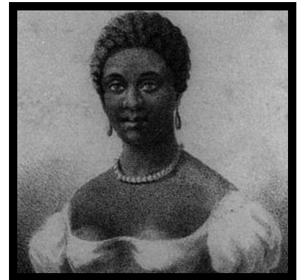
Born around 1753, Phillis Wheatley was the first black poet in America to publish a book.

‘Twas mercy brought me from my Pagan land, Taught my benighted soul to understand That there’s a God, that there’s a Saviour too: Once I redemption neither sought nor knew. Some view our sable race with scornful eye, “Their colour is a diabolic die.” Remember, Christians, Negros, black as Cain, May be refin’d, and join th’ angelic train.